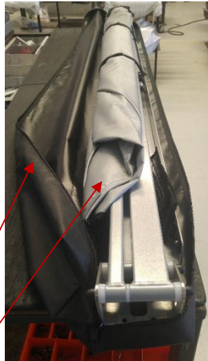
Top of awning assembly

Step 1: Place the awning bag on a flat work bench or table and open the zip. Place awning assembly into the bag.