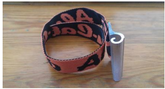
Figure 2: C-Clamp Extrusion Strap