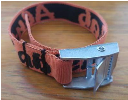
Figure 3: Buckle Strap