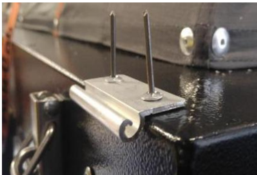
Figure 7: Rivets in C-Clamp Extrusion