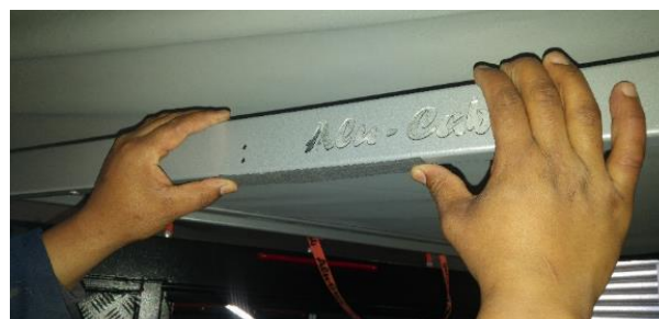
Figure 16: Black Adhesive foam strip attached

There are two black adhesive foams strips provided with the awning. Peel the white plastic off and stick these foam strips to the bottom of the awning arms to prevent the side and rear doors of a canopy, camper or any other vehicle from fouling the awning arms.