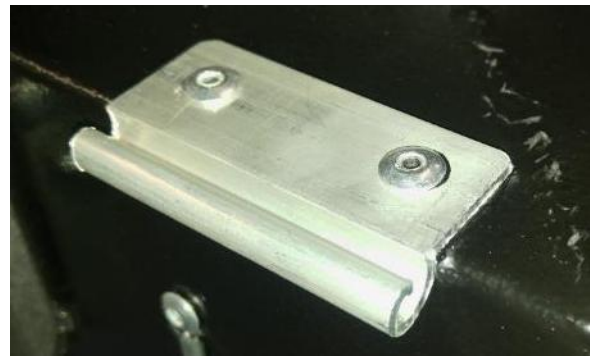
Figure 8: C-Clamp Extrusion riveted in place