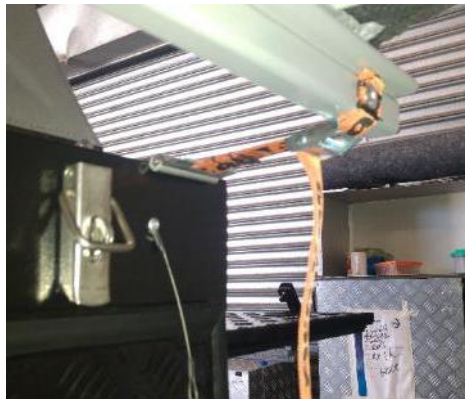
Figure 15: Awning tightened to rear of vehicle