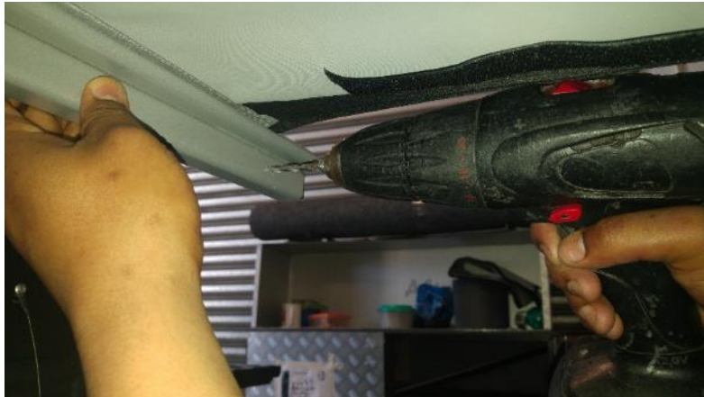
Figure 10: Drilling the hole into the last