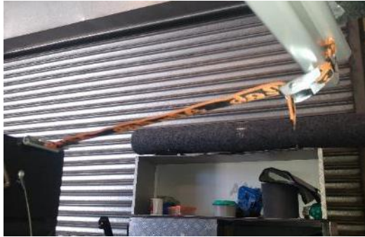
Figure 13: C-Clamp Extrusion strap into buckle