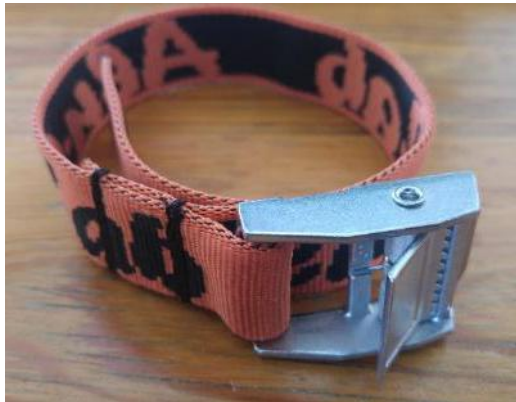
Figure 3: Buckle Strap