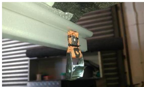
Figure 12: Buckle strap riveted onto awning arm