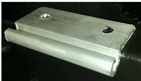
Figure 6: C-Clamp extrusion with holes drilled into vehicle

Place the C-Clamp Extrusion on the vehicle in position and drill the mounting holes into the vehicle / Alu-Cab base unit using the extrusion holes as a guide. This is done using a hand drill and a 4.8mm drill bit.