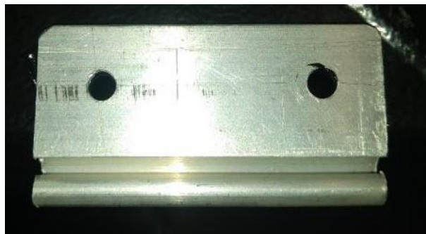
Figure 5: C-Clamp extrusion with holes drilled

Always double check your intended location, before drilling and mounting!