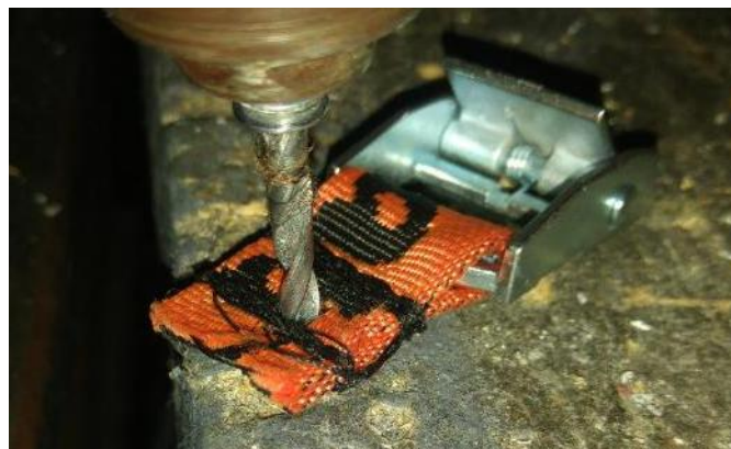
Figure 11: Drilling the hole into the buckle