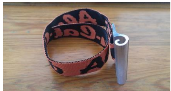
Figure 2: C-Clamp Extrusion Strap