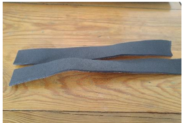
Figure 4: Black adhesive foam strip