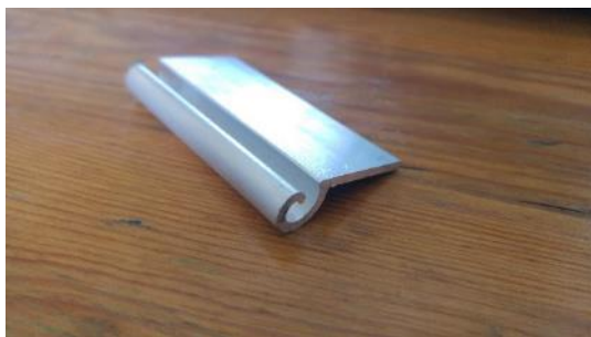
Figure 1: 38mm Extrusion Alu