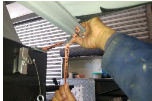
Figure 14: Tightening of strap