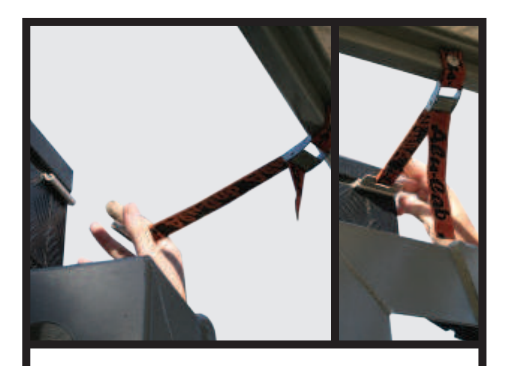
Step 4: Clip the strap onto the rail at the back of your vehicle.

Step 5: Tighten the strap by pulling the loose end of the strap away from the cam buckle.