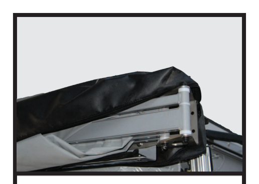
Step 1: Open zip.

Step 2: Flip the bag clear of the hinge.