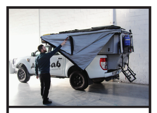
Step 4: Holding the strap, walk around to the front of your vehicle, to the front of the awning frame. Make sure that bystanders keep clear!

Step 3: Release the cam buckle on the strap at the rear of your vehicle and unhook.