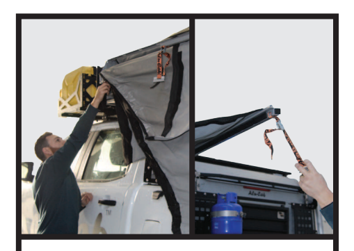
Step 3: Grab the strap on the top arm and pull it with you as you walk to the rear of your vehicle. Make sure that bystanders keep clear!

Step 4: Grab all the arm ends and lift out of the cradle.