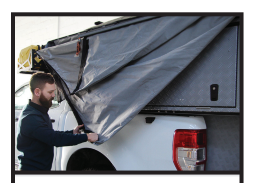
Step 5: Push the awning arms flat against the awning frame. Step 6: Grab the two lower canvas folds and roll the canvas upwards.