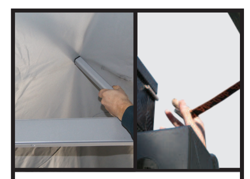
Step 2: Drop the centre bar on the middle arm until it lays flat.

Step 3: Release the cam buckle on the strap at the rear of your vehicle and unhook.