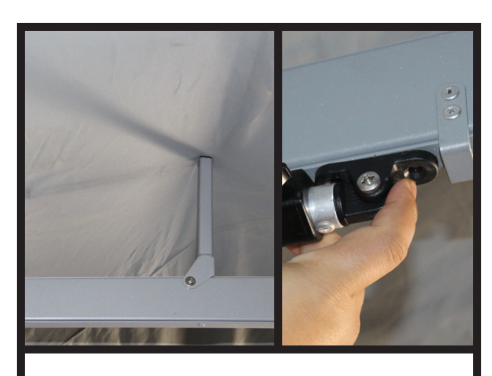
Step 6: Raise the centre bar on the middle arm until it locks into place.

Step 5: Tighten the strap by pulling the loose end of the strap away from the cam buckle.