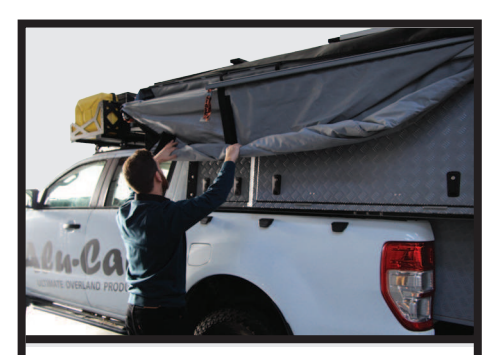
Step 7: When the third canvas fold is exposed, include it into the roll and carry on rolling upwards until the canvas roll is tight against the awning arms.