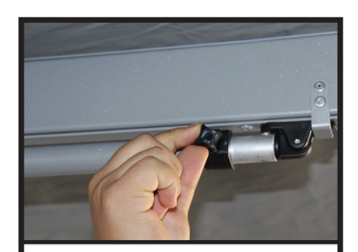
Step 1: If the centre support leg was deployed, loosen its thumb screw and fold the leg up to the awning arm. To secure, slot the support foot into the cradle and then tighten the thumb screw.