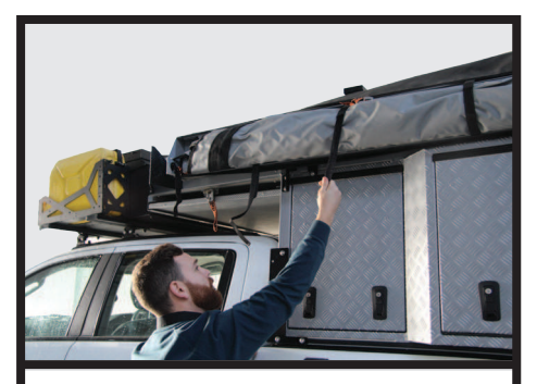
Step 3 : Undo the three Velcro straps.

Step 2: Flip the bag clear of the hinge.