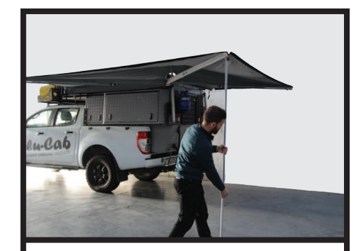
Step 8: With the foot of the centre support leg on the ground, raise the awning slightly, and tighten thumb screw on the pole.

Step 7: If required, drop the centre support leg. Loosen the thumb screw and then pull the support foot out of its housing.