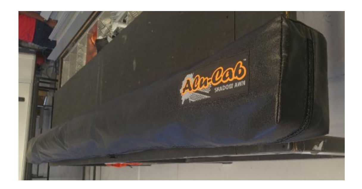
Step 4: There are 4 pre-drilled 4.8mm holes in the awning back plate for the rivets, the drawing below shows their locations on the back plate. Use a 4.8 mm drill bit and a drill to drill through the awning bag into the 4 holes mentioned in step 4. Use the drill in reverse to avoid drilling too far through the awning bag and possibly into the awning canvas inside the awning assembly.