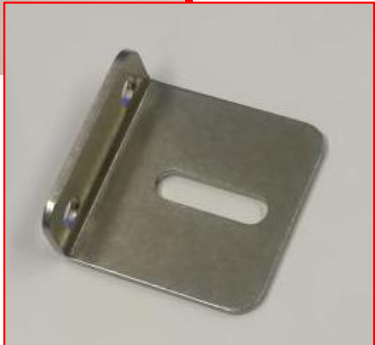
Bottom Mounting Bracket