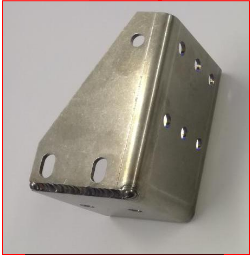
Awning Mount Bracket