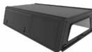
Explorer [ Smooth / tread ]