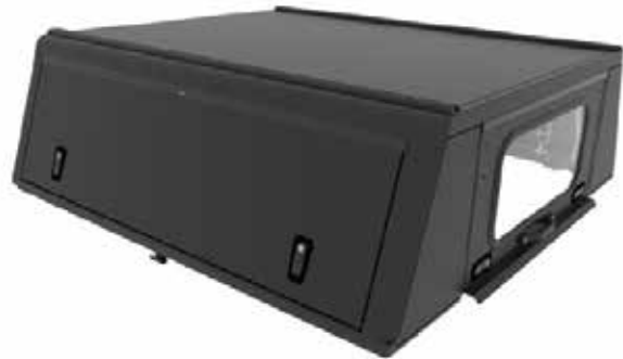
SMOOTH - Available in black & silver