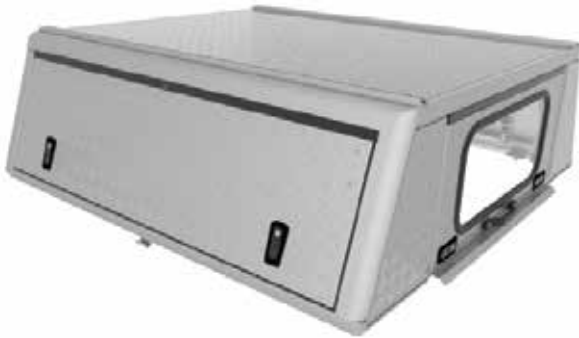
TREAD - Available in black & silver