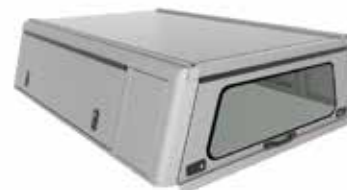
Adventurer [ Smooth / tread ]