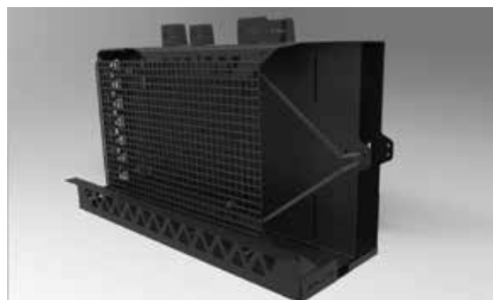
Double chair carrier