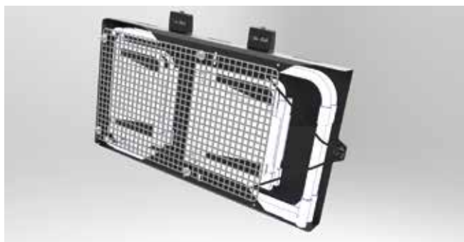
Single chair carrier