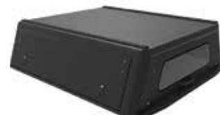
Adventurer [ Smooth / tread ]