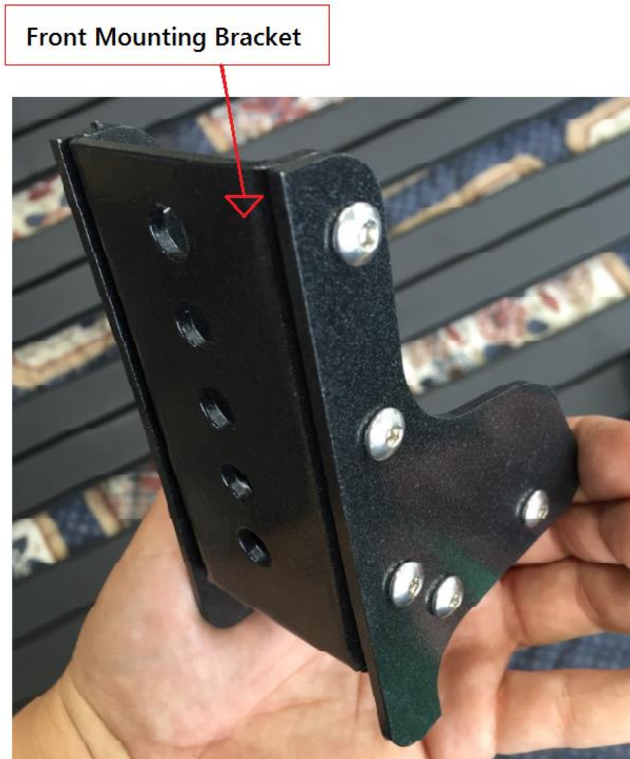
Figure 1: Rhino Rack Front Mount

In Figure 1 below is the assembled front mounting bracket consisting of one L bracket and two flat side plates. This bracket is riveted together with the ten 3mm rivets provided. (Figure 1)